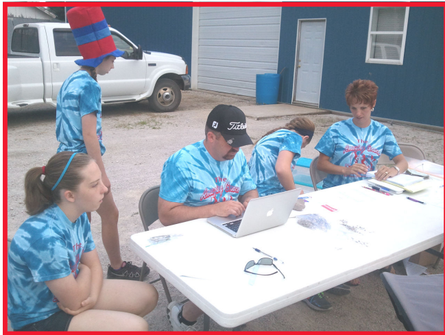
Pictured above: Sign up table by the Coffel Family.

Proceeds were donated to help with the costs of the Blue Mound Independence Day Celebration