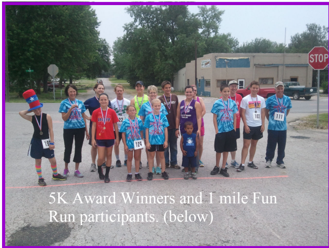
5K Award Winners and 1 mile Fun Run participants. (below)